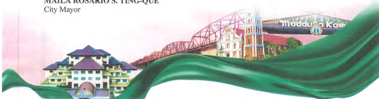
MAILA ROSARIO S. TING-QUE City Mayor