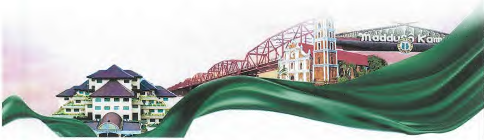
MAILA ROSARIO S. TING-QUE City Mayor